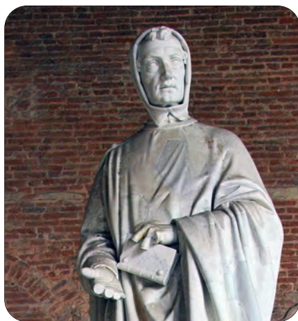
Hans-Peter Postel CC BY

Statue of Leonardo of Pisa (1170–1250, approximate dates), also known as Fibonacci.